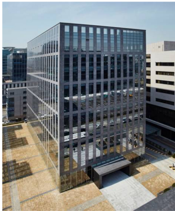
<Whole view of the company>